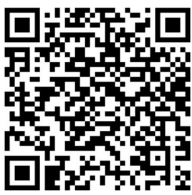
PREVENTION SKILLS YOU CAN USE

This is a resource users can come back to as often as they need it. Scan the QR code, or go to www.usmc-mccs.org/protect to access the resource. Once on the page, click on the Prevention Skills You Can Use button.