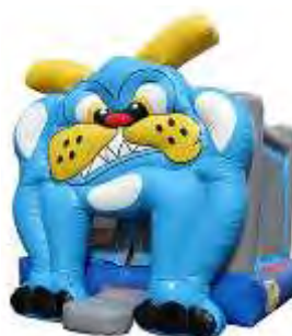
Bulldog Bounce House Large Daily: $120.00 Weekend: $150.00