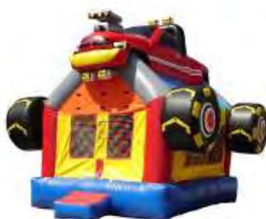
Monster Truck Bounce House Daily: $120.00 Weekend: $150.00