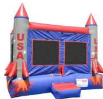
Rocket Bounce House Large Daily: $120.00 Weekend: $150.00

The Elmore MCX and Barber Shop will be closed 1/09/2023 due to annual physical inventory.