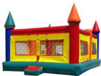
20 x 20 Castle Bounce House Daily: $200.00 Weekend: $275.00