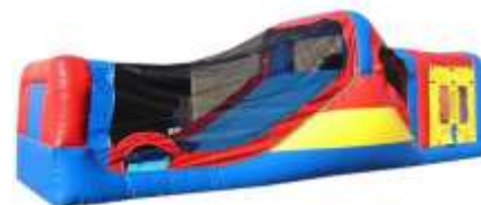
Happy Slide and Jump Combo Daily: $200.00 Weekend: $275.00

Telephone: 757.749.5226 or outdoorrec.mccshr@usmc-mccs.org